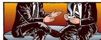
BILL W. and Dr. BOB