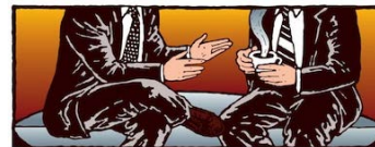
BILL W. and Dr. BOB

12:00 noon, Melody 560 Higuera St., Suite E, S.L.O.