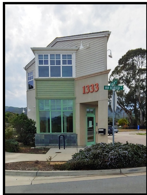
1333 Van Beurden Drive, Los Osos